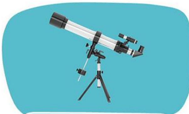
Telescope on a tripod

These stars were photographed at Bolton Abbey, North Yorkshire. If they were viewed through a telescope, they would appear closer and could be seen in more detail.