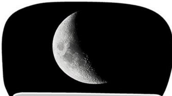
Here we can see a telescopic view of a quarter moon.