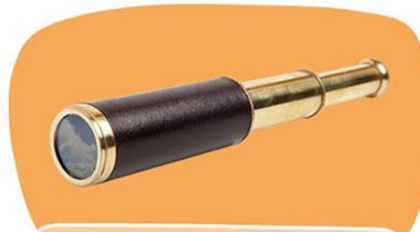
Handheld telescope (monocular)

What does the Moon look like when you look at it? Do you think it looks different through the telescope?