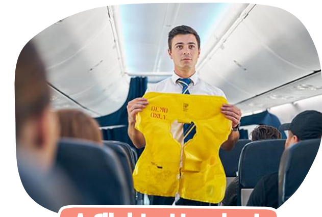
A flight attendant

Why do you think people need to wear these uniforms/outfits? Do you think they should be able to choose what they wear to work?